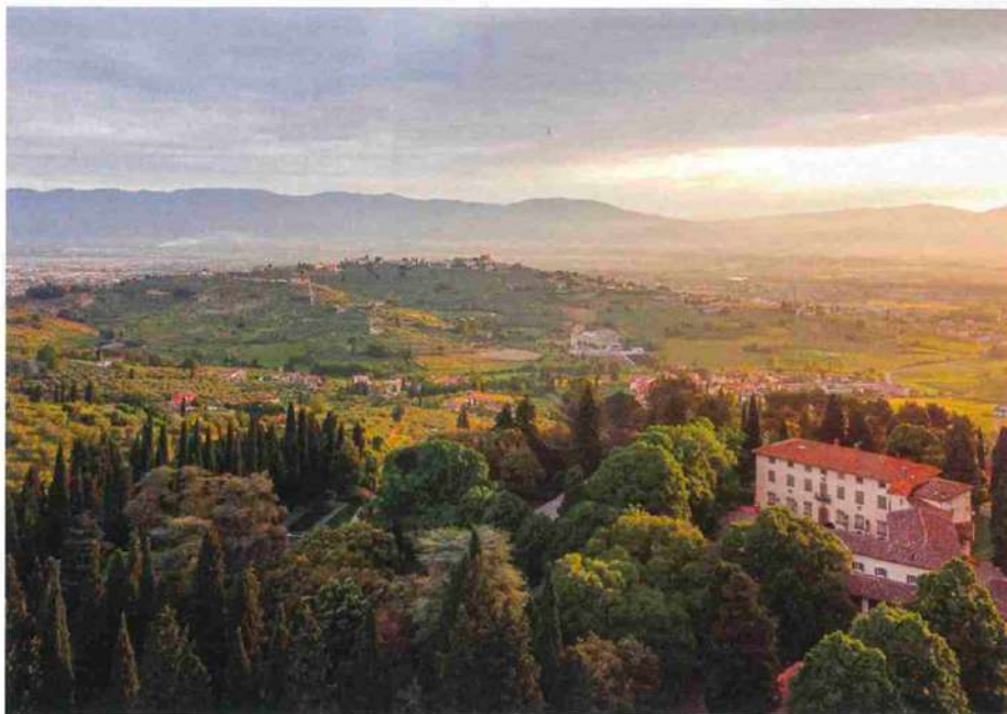
Capezana is one of the top estates in the small appellation of Carmignano, where Cabernet Sauvignon thrives on the sloping hillsides.

A pair of 96-point 2018s also hail from Chianti Classico. The muscular Castello di Monsanto Chianti Classico Il Poggio Gran Selezione 2018 (96, $80) offers both savory and fruity notes, while the rich, mineraly Rocca di