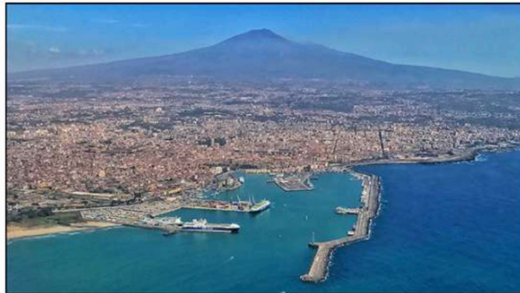
Here is a view of the Etna volcano and the city of Catania as seen from my airplane window seat a few moments after departure.

As I have done in past years, my Etna reviews are being published in an article separate from my reviews from the main island of Sicily. I do this to draw attention to the Etna wine appellation that really is a world apart. Like the Sicily reviews, these wines were tasted in part at the Assovini Sicilia preview tasting in Palermo and at my home office in Rome.