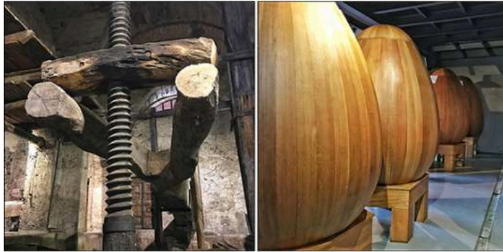
The old versus the new: Etna is home to startling examples of innovation and tradition. This abandoned Palmento (or wine press) is located inside Alberto Aiello Graci's winery in Passopisciaro. A new way of making wine on Etna includes these high-tech oak egg fermenters seen at Palmento Costanzo.