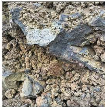
The volcanic soils of Etna include lava from newer flows and compressed ash and eroded material from ancient flows. The soils are mixed by composition but most importantly by age (of the lava flow), which can vary by thousands of years in a single vineyard site.