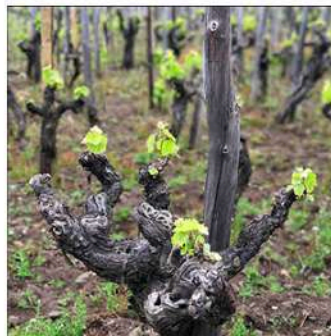
This is an ancient vine of Nerello Mascalese in the Contrada Feudo di Mezzo, one of the most celebrated single vineyards on the volcano. The photo of the vine in the banner image above is from the same site.